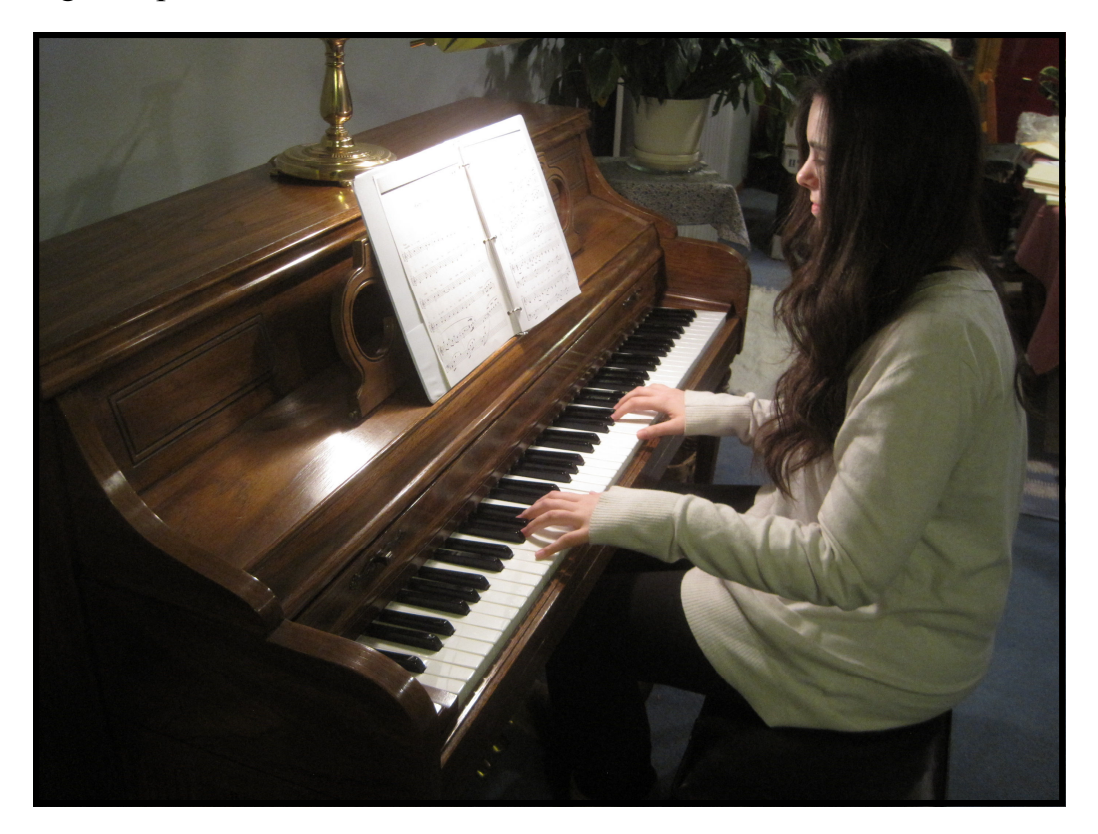
A freshly tuned console piano provides an enjoyable playing experience for beginners and accomplished pianists alike!

With proper maintenance, a good quality console piano will be a delight to play, providing a responsive touch and a commendable tone.