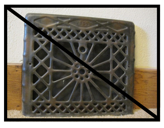
1. Hot air registers—dry, heated air blowing directly on the back of a piano is particularly bad for the soundboard.

Environment: While tuning, repairs, regulation and voicing are the job of the technician, seeing to it that your console piano is placed in an appropriate spot within your home is up to you. What is needed, as much as possible, is a location where temperature and humidity are kept at moderate levels year-round. Drafty locations, or areas where wide swings in either temperature or humidity occur (for example, unheated porches, moldy basements, etc.) are unsuitable for any piano. In particular, avoid placing your piano in front of either of the following: