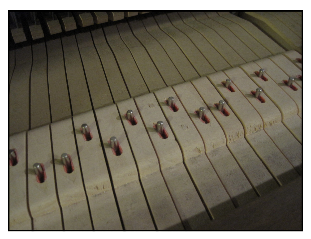
A console piano gives the advantage of full-length keys.