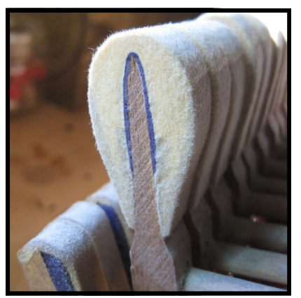
Worn hammer after filing

Yes, if the amount of wear is minimal, the hammers may be suitable for a job of reshaping and voicing. However, if the cuts in the felt are deep, reshaping may not be feasible.