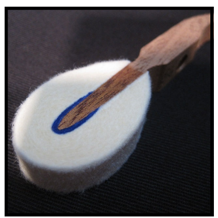
New replacement hammer

If the amount of felt to be removed during the shaping process is significant (the photos above contrast the thin layer of felt remaining on the reshaped hammer to the thicker layer of felt of the corresponding replacement hammer), total replacement with a new set of hammers would be a better choice. Otherwise, the changes to the weight and dimensions of the hammers which result from shaping would adversely alter the touch of the piano. Page 3