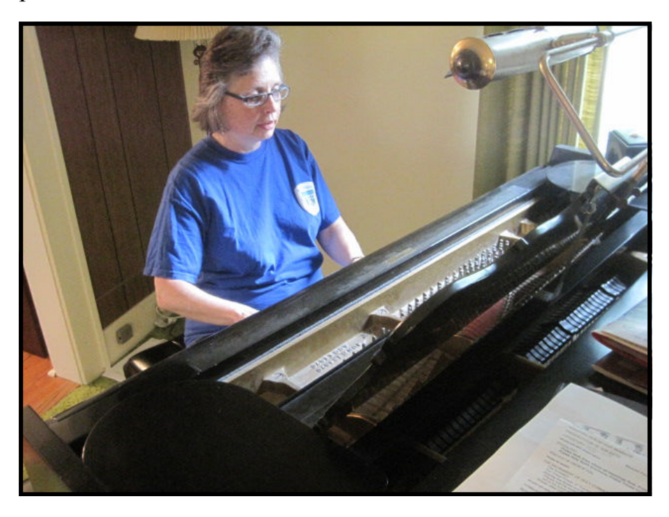
Sitting down to play on a freshly tuned grand piano is a wonderful experience!

<u>As an owner of a grand piano, you have the good fortune to be able to</u> <u>play and enjoy the piano of choice for many musicians.</u> With proper maintenance, a quality grand will give outstanding performance for generations of musicians. The tone and touch of a grand piano set it apart from other types of pianos. Since the design of the grand piano was perfected early in the previous century, no matter what the age of your instrument, you certainly have the "top the line" when it comes to performance and sound.