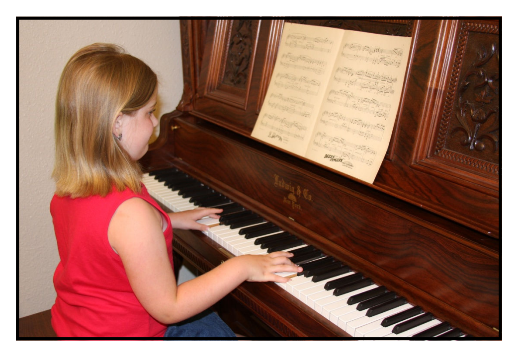
Sitting down to play on a freshly tuned upright piano is a wonderful experience for performers of all ages and ability levels!

As an owner of a vintage, upright piano you have the privilege of playing music on an instrument that was built around the same time that the first Model T Fords were roaming the countryside! With proper maintenance, upright pianos a century old or even older may be enjoyed daily, and have the potential to perform and sound as beautiful as the day they were built. "Planned obsolescence" was definitely not an idea that had occurred to the builders of these wonderful instruments! They were built to last!