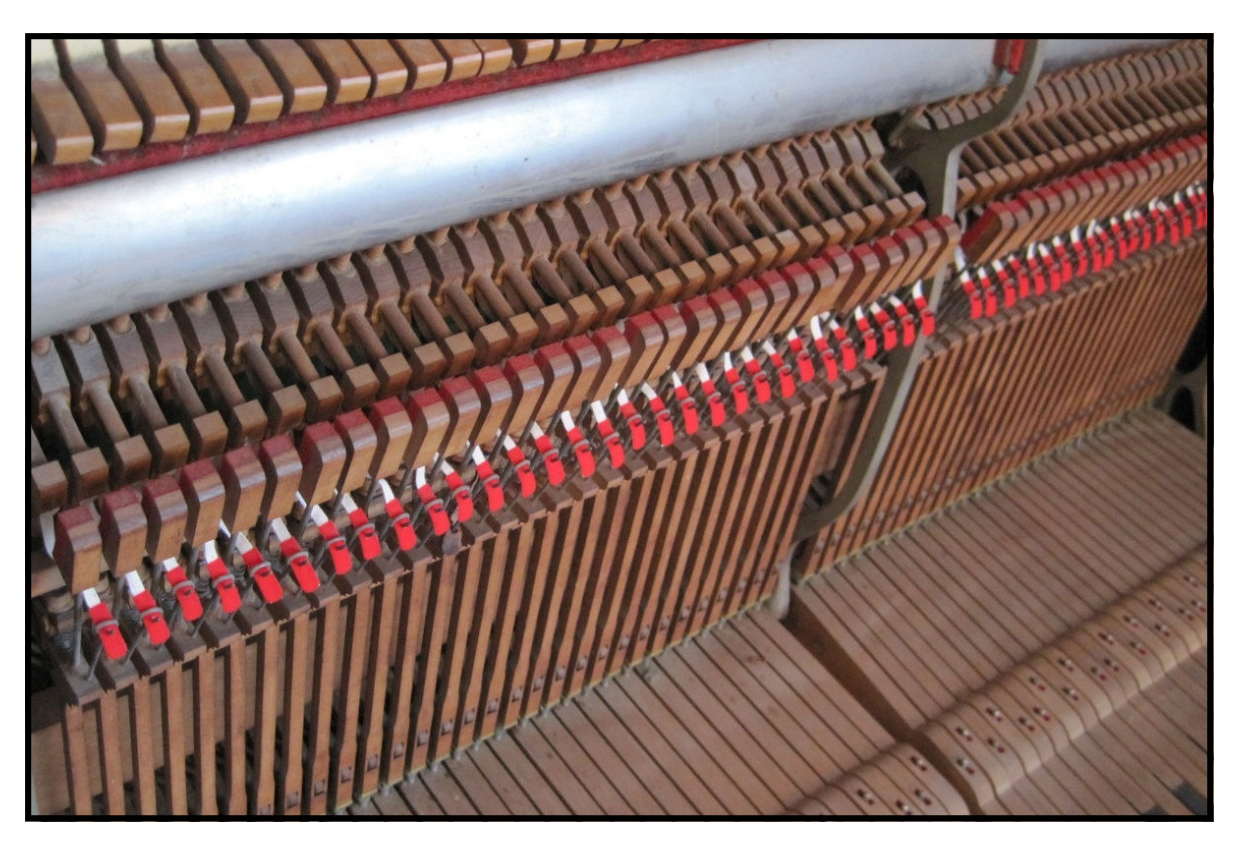
A newly repaired upright piano action, installed and ready for regulation..