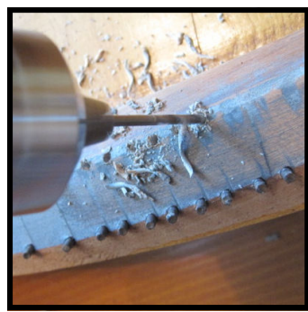
New holes are drilled.

With the bass strings temporarily removed from the bridge and bundled out of the way, the loose bridge pins will be pulled out completely so that the epoxy filler may be used. This epoxy cures rapidly as a result of the chemical reaction to the two components that are mixed together on the spot. Within a short amount of time, the hardened epoxy is ready to sand and drill for the reinsertion of the bridge pins.