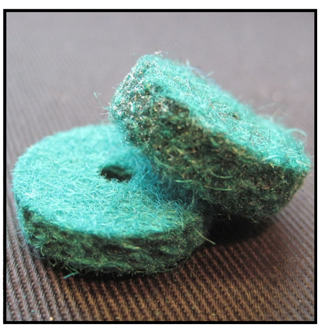
Thinnest and thickest front rail punchings.

Keybed felts come in a range of thicknesses, so that the original size of the felt installed at the factory may be duplicated. Paper and card punchings as thin as .002" are used under the felts for final adjustments necessary for level keys and even key dip.