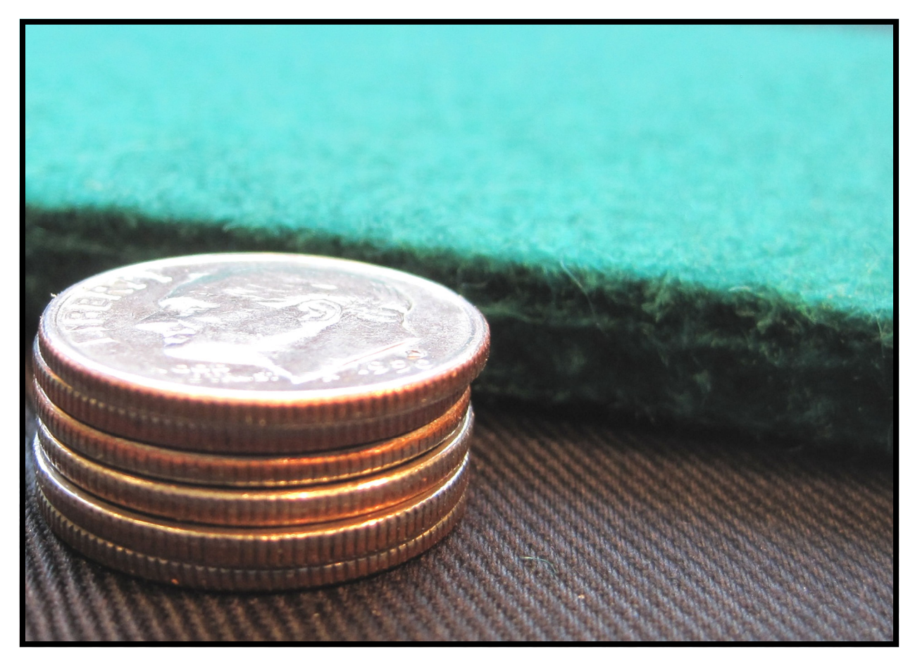
The thickness of heavy backrail cloth equals that of six dimes.