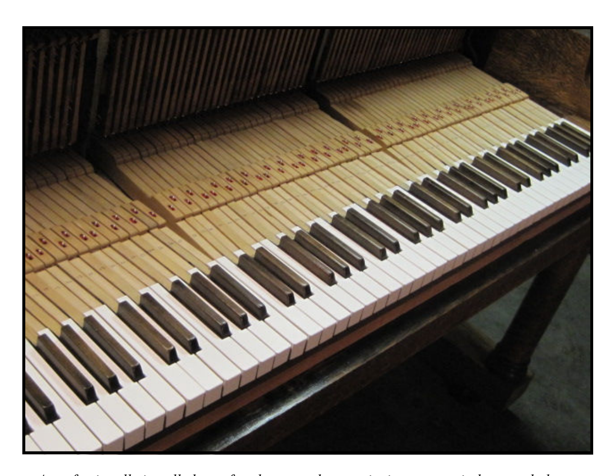
A professionally installed set of replacement keytops invites one to sit down and play.